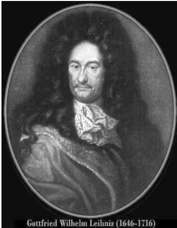
Gottfried Wilhelm Leibniz (1646-1716)